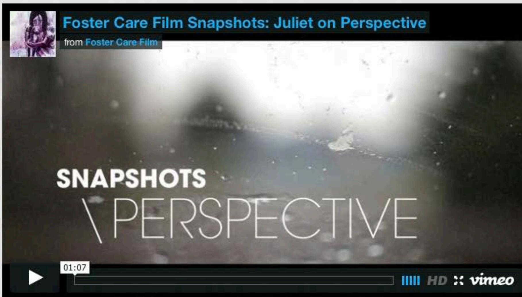
Foster Care Film Snapshots: Juliet on Perspective from Foster Care Film on Vimeo.